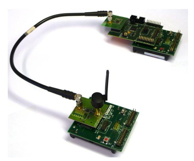
Figure 2 - Possible set up of CC2591 + radio (no control signals)

The picture below shows one possible set up where the output of a radio is connected to the radio input of the CC2591. Note that since there are no discrete control lines between the radio node and CC2591 in the example below, control of the LNA and PA enable signals has to be done manually by placing jumpers on header P5.