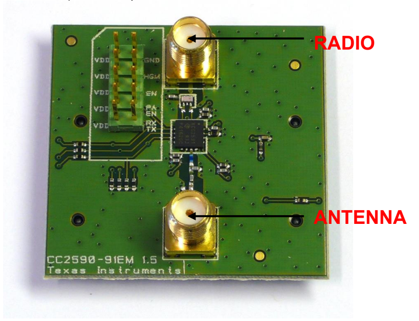
Figure 1 - CC2591EM

The CC2591 standalone EM can be used as a simple add-on to your existing system to improve output power and sensitivity. Use a 50 Ohm coaxial cable with SMA connectors to connect the RF signal from the radio to the CC2591EM connector P4 (top side of EM). Connect the antenna to connector P3 (bottom side of EM). See the picture below to locate the connectors.