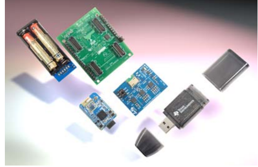
DK-EM2-2560B Kit Contents

The Stellaris® 2.4 GHz CC2560 Bluetooth ® Wireless Kit provides the tools engineers need to set up and develop wireless applications right out of the box including: