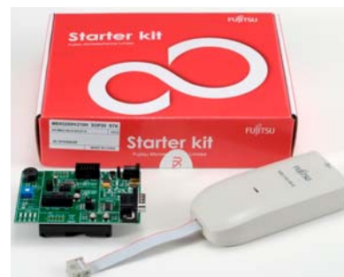
STARTER KIT MB2146-420A-01-E