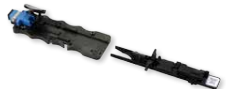
3M™ No Polish SC Connector Assembly Tool 8865-AT