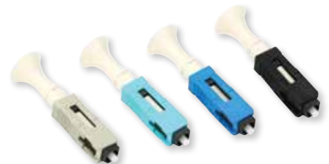
3M™ No Polish SC/UPC Connectors

The No Polish Connector meets EIA/TIA 568-B.3, IEC requirements and is RoHS Compliant.*