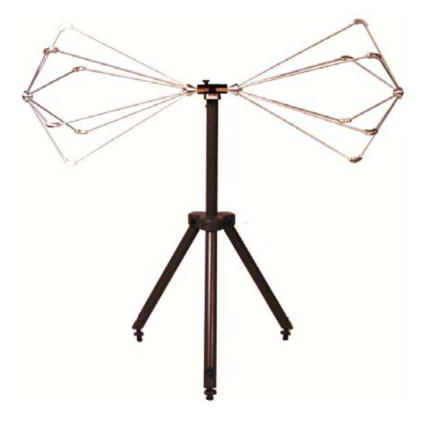
The TDK PBA-2030 Precision Biconical Antenna features a patent pending design that provides optimum performance over the frequency range of 20 MHz to 300 MHz.

Precision Design Designed in-house by our product design engineers, the PBA-2030 is manufactured using tight-tolerance, precision fabrication methods to minimize intrinsic uncertainties. This mechanically-precise, weld-free design yields predictable performance and delivers accurate, consistent measurements.