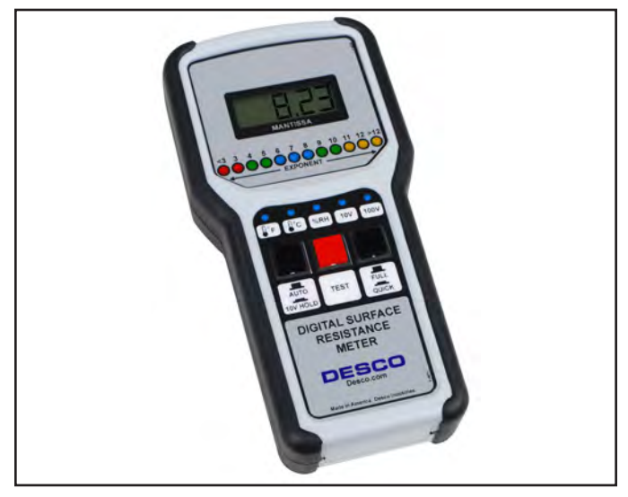
Figure 3. Desco <u>19788</u> Digital Surface Resistance Meter