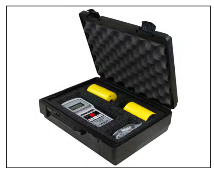
Figure 2. Desco <u>19787</u> Digital Surface Resistance Meter Kit