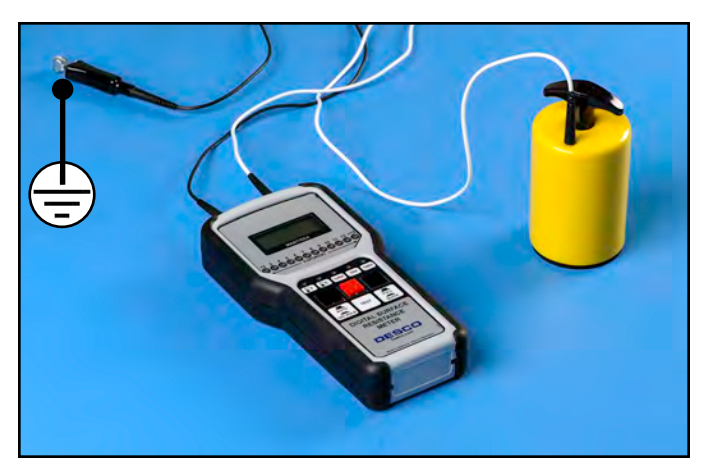
Figure 5. Rtg test setup

If the measurement is outside acceptable limits, clean the surface with an ESD cleaner containing no insulative silicone such as Reztore™ Antistatic Surface & Mat Cleaner, and re-test to determine if the cause of failure is an insulative dirt layer or the ESD worksurface material.