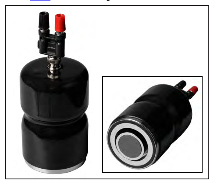
Figure 7. Desco 50005 Concentric Ring Probe

The Desco 50005 Concentric Ring Probe is an instrument to be used in conjunction with a resistance meter, such as the Desco 19787 Digital Surface Resistance Meter, to measure surface resistance per ANSI/ESD STM11.11 the test method listed in Packaging standard ANSI/ESD S541 for surface resistance of planar materials.