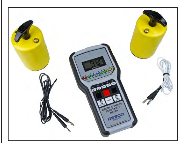
Figure 1. Desco Digital Surface Resistance Meter Kit