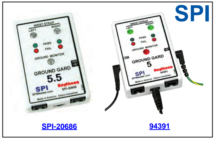
Figure 1. SPI Ground Gard items SPI-20686 and 94391