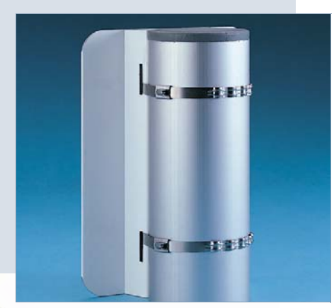
SIGN HANGING APPLICATION