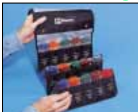
PAN-POUCH is 10 1/2" x 36" (266mm x 914mm) made of canvas and folds to 10 1/2" x 6" (266mm x 152mm) for easy storage.