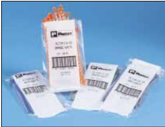
Each package contains 50 cable ties.

PANDUIT PAN-TY Miniature Cross Section Cable Ties come in convenient packages of 50 each with perforated, tear-off tops and are sized to fit into the individual pockets of the PAN-POUCH .