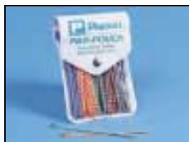
Pocket Pouch is 3 1/2" x 5 1/4" (89mm x 133mm) and holds (5) 50 pc. packages.