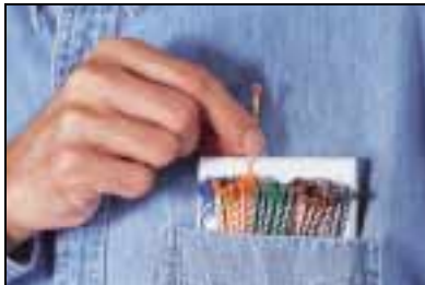
PANDUIT Pocket Pouch PP5x50F filled with color-coded PAN-TY Cable Ties fits easily in shirt pocket.