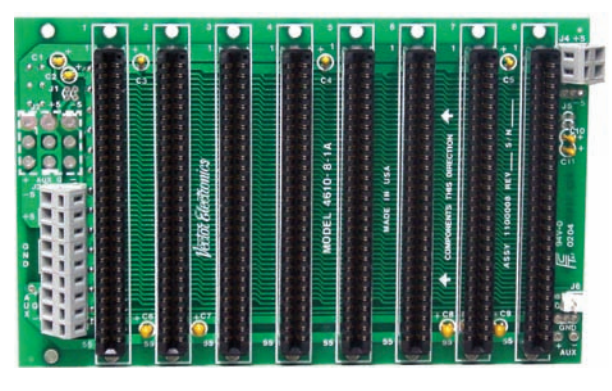
Model 4610-8-1A 8-slot STD Backplane