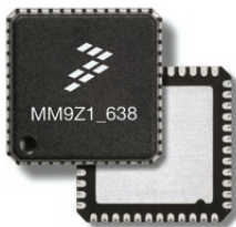
(PB-FREE) 48-PIN QFN-EP 98ASA00343D