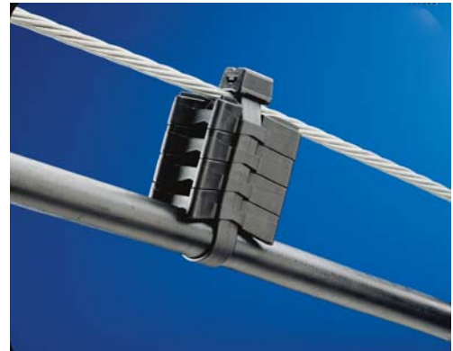
Material Data- Strap and Head

The El-Ty consists of a smooth strap and a separate, compact plastic head which encloses a stainless steel gripper. The stackable spacer accepts cable ties up to 1/2" wide for a versatile, easy to install spacing system.