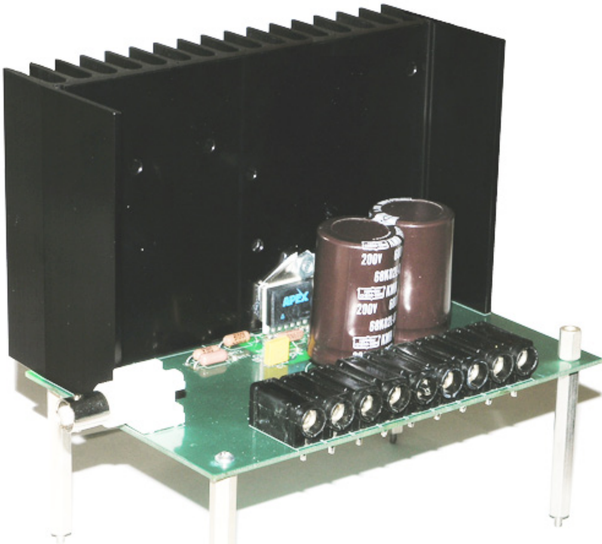
FIGURE 2 - EK71 Assembly