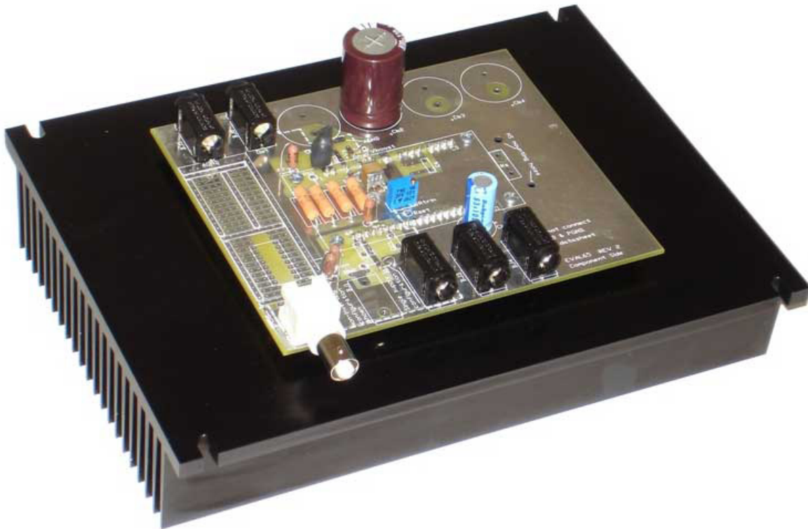
Figure 3 - EK65 Assembly