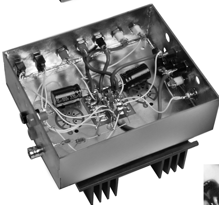
Figure 3. Inside of assembled box. Holes for components on long side were user drilled.