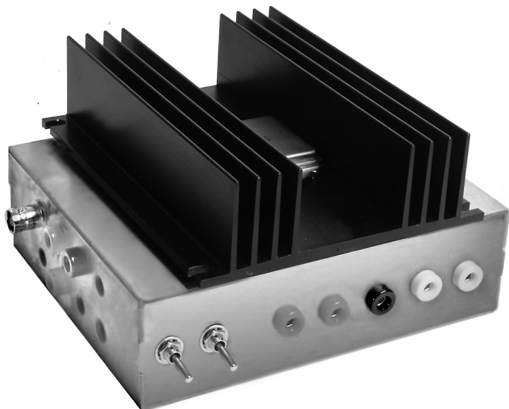
Figure 2. External with heatsink (heatsink, amplifier, connectors and switches not supplied).