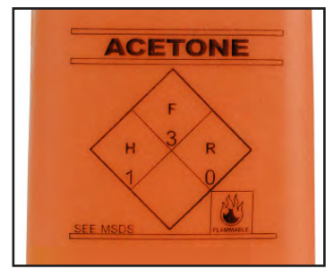
Note: Printed bottles eliminate the need for additional labels - custom printing available.