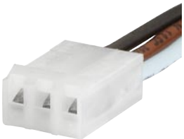
Wire Harness Wire harness for SCHURTER products