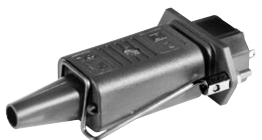
Cord retaining kits Cord retaining strain relief